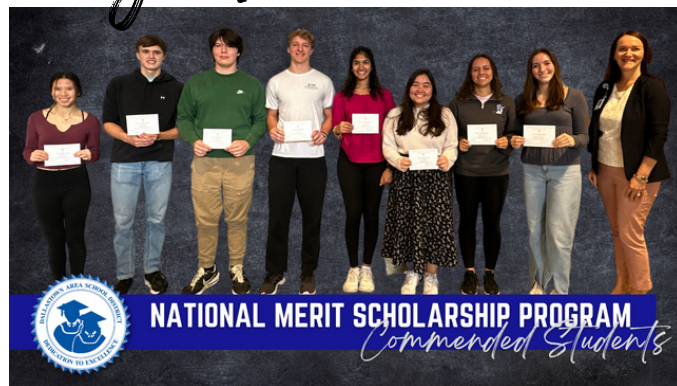
National Merit Scholarship Commended Student