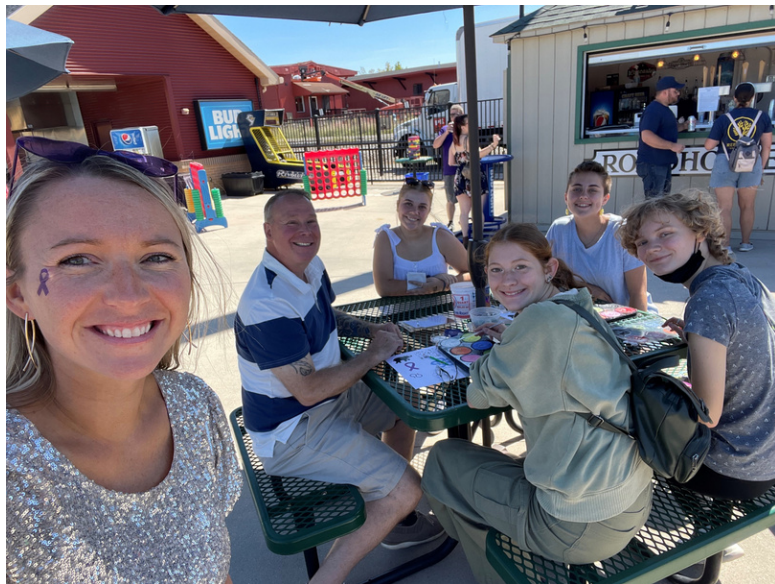
The NAHS participated in face and hand painting along with hand tattoos at the Music Never Fades Event at the Revs Stadium on September 16, 2023 in York, PA to support Alzheimer's.