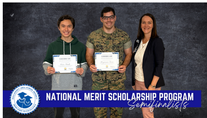
National Merit Scholarship Semifinalist